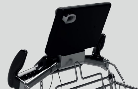
Back of the clip-on holder